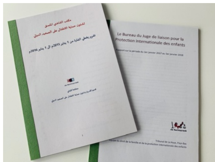
The 2015 annual report in Arabic and the 2017 annual report in French

The annual report is written in Dutch and then translated by a professional translator into English. For some years, the report was also translated into French and Arabic, but for reasons of cost control, this practice was abandoned after some years. The annual report is available digitally and (upon request: blik@rechtspraak.nl ) also in hardcopy. It is also published on (semi) open sources such as the intranet and internet.