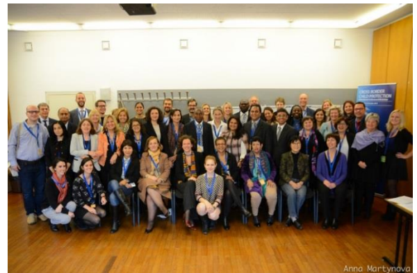
International Family Mediation Workshop 23 October 2015, Geneva

This international group - 55 practitioners from 23 countries - met in Geneva in October 2015 2 : they adopted 10 core principles and developed more than 25 good practices to be considered in the Charter's development.